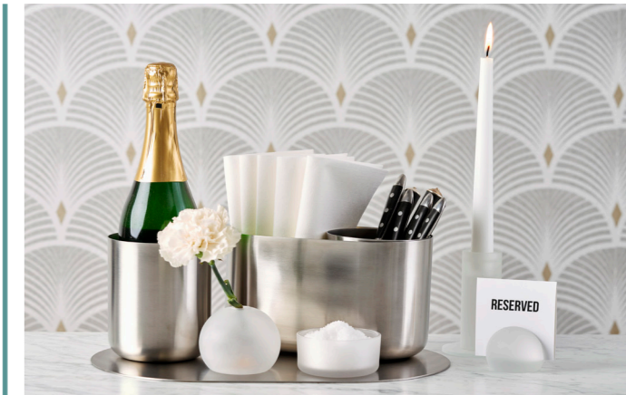
Table runners and placemats are ideal when your customers don't want fully covered tables. Napkins and napkin pockets transform tables with colour and design. LED lighting is rechargeable, energy efficient and will last through the whole event.

Banquet reels are perfect for long tables.